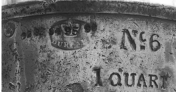
V Crown R over 157 for Winchester City