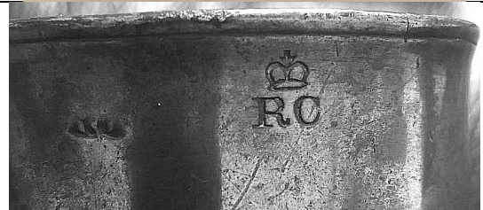
Richmond Borough Mark